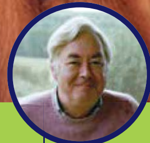
American Masters: Moynihan