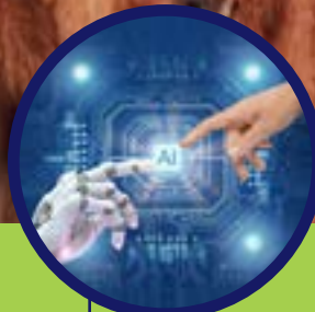
NOVA: A.I. Revolution