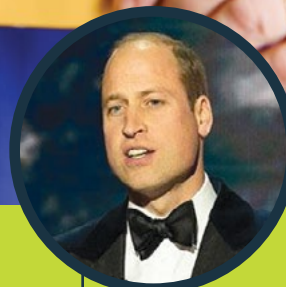
The Earthshot Prize 2023