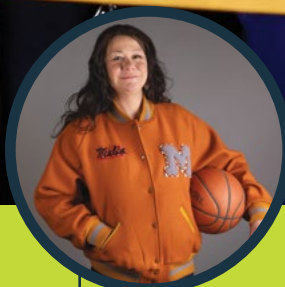
Native Ball: Legacy of a Trailblazer