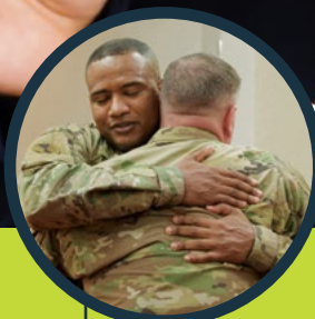
Independent Lens: Three Chaplains