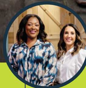
The Great American Recipe: Finale