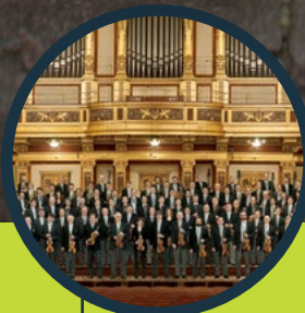
Vienna Philharmonic Summer Night Concert 2023