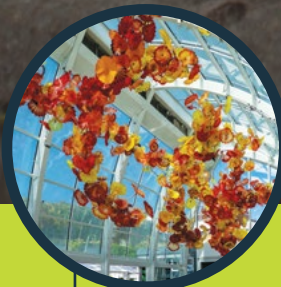
Chihuly - Roll the Dice: The Making of Rotolo