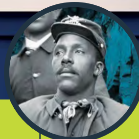
Buffalo Soldiers: Fighting on Two Fronts