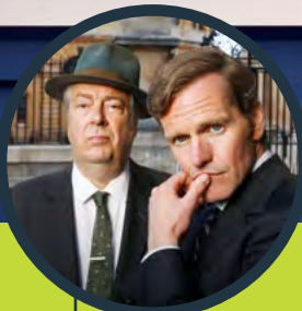
Endeavour on Masterpiece